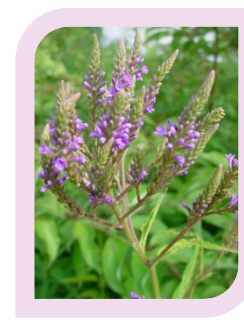
Blue vervain Verbena hastata