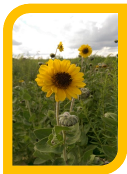
Ashy sunflower Helianthus mollis