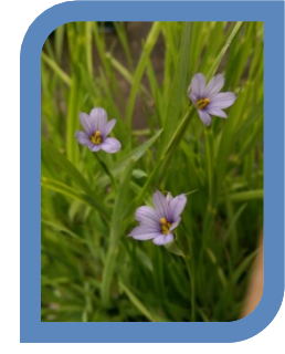
Blue-eyed grass Sisyrinchium angustifolium