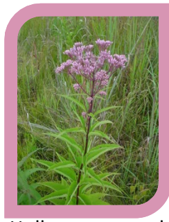
Hollow-stemmed Joe-pye weed Eutrochium fistulosum