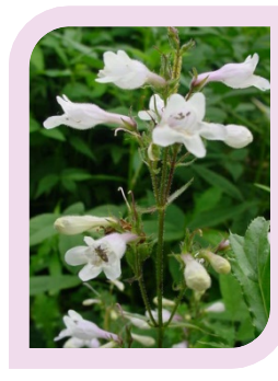
Foxglove beardtongue Penstemon digitalis