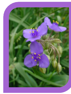
Ohio spiderwort Tradescantia ohioensis