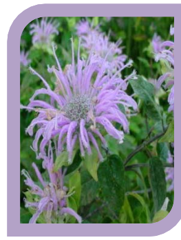
Wild bergamot Monarda fistulosa