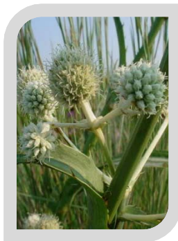
Rattlesnake master Eryngium yuccifolium