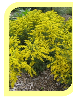
Gray goldenrod Solidago nemoralis