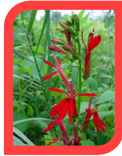
Cardinal flower Lobelia cardinalis