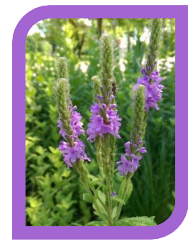
Hoary vervain Verbena stricta