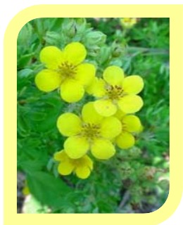
Shrubby Cinquefoil Dasiphora fruticosa